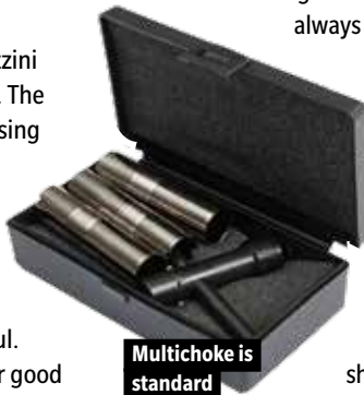
Multichoke is standard

On the looks front, the Rizzini Regal gets it exactly right. The round-body action is pleasing and the engraving and wood are excellent, but not over the top. This gun isn't 'blingy', with things like gold-plated triggers, it's tasteful. The Italians have a flair for good taste and beautiful design. As such, the Regal would make a good prop on a driven shoot, but is its performance as