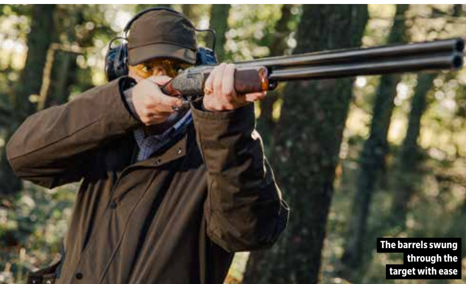
The barrels swung through the target with ease

This gun sits in a well-populated and tough segment of the market where shooters begin to pay serious money for a gun. All I can say is that whoever buys a Regal Extra will be happy with their purchase. ■